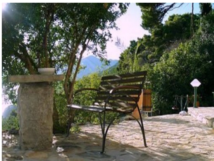
Great views from terrace