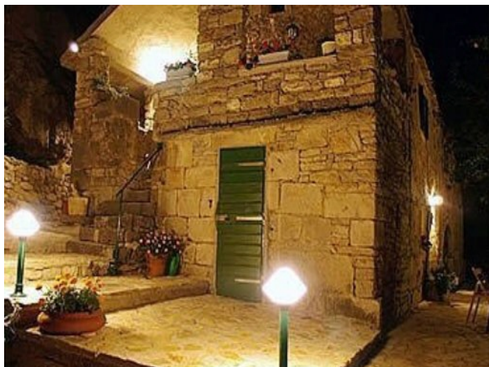
Villa at night