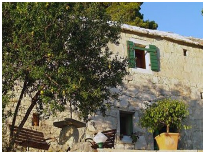
Fully renovated stone villa