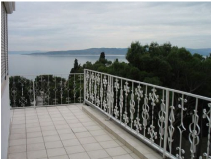
Terrace with seascape