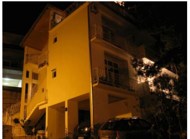
View from outside